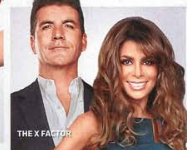
THE X FACTOR