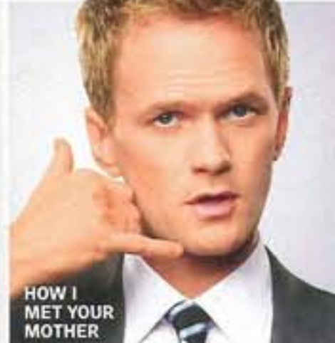
HOW I MET YOUR MOTHER