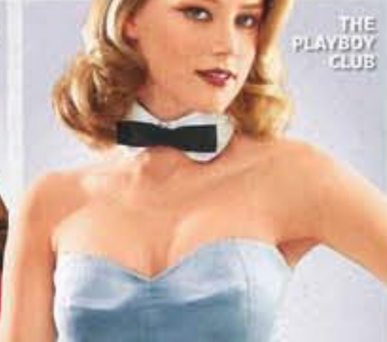
THE PLAYBOY CLUB